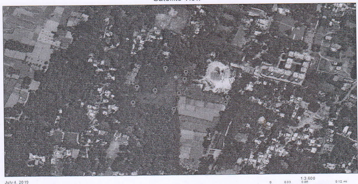
July 4, 2019